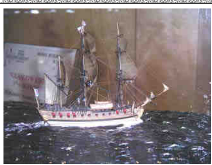
Hewitt's HMS GLASGOW