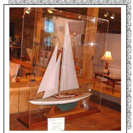
Howie Franklin's FORMULA RACER took third place in the "Scale Model" category