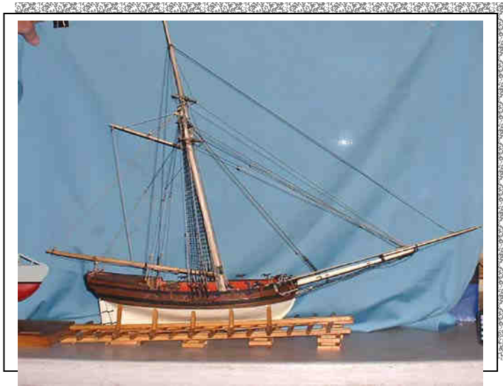
Marc Malopy's ARMED VIRGINIA SLOOP