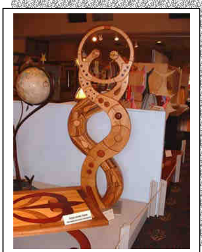
This year there were two.