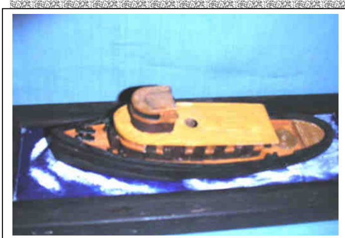
Model Shipways kit TAURUS by C. A. Peabody . HO scale (1:86) model of a 1900s steam tow boat.