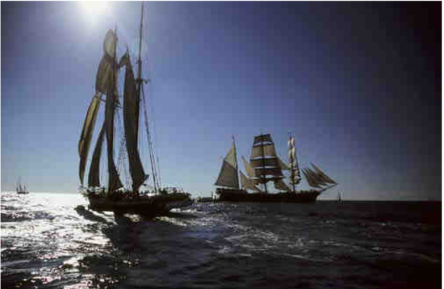
The Star of India and Californian at Sea in the past. HMS Surprise will join them November 11 & 12 this year.