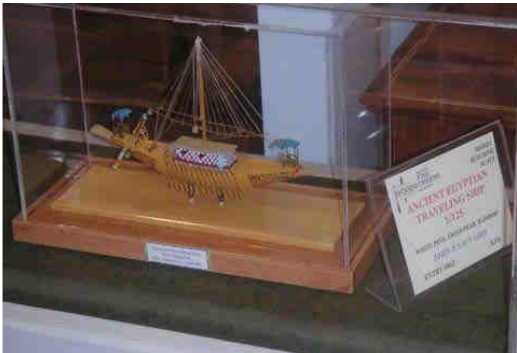
First Place: Egyptian Royal Barge by Jon Sauvajot