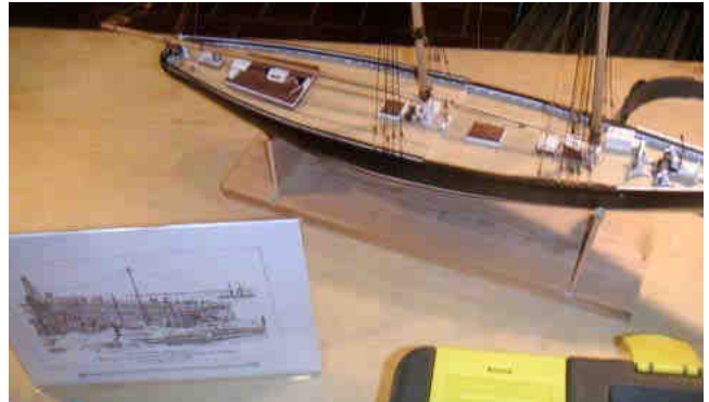
Gary Seaton's Bluenose