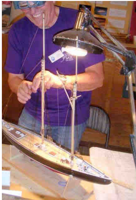
Gary Seaton's Bluenose