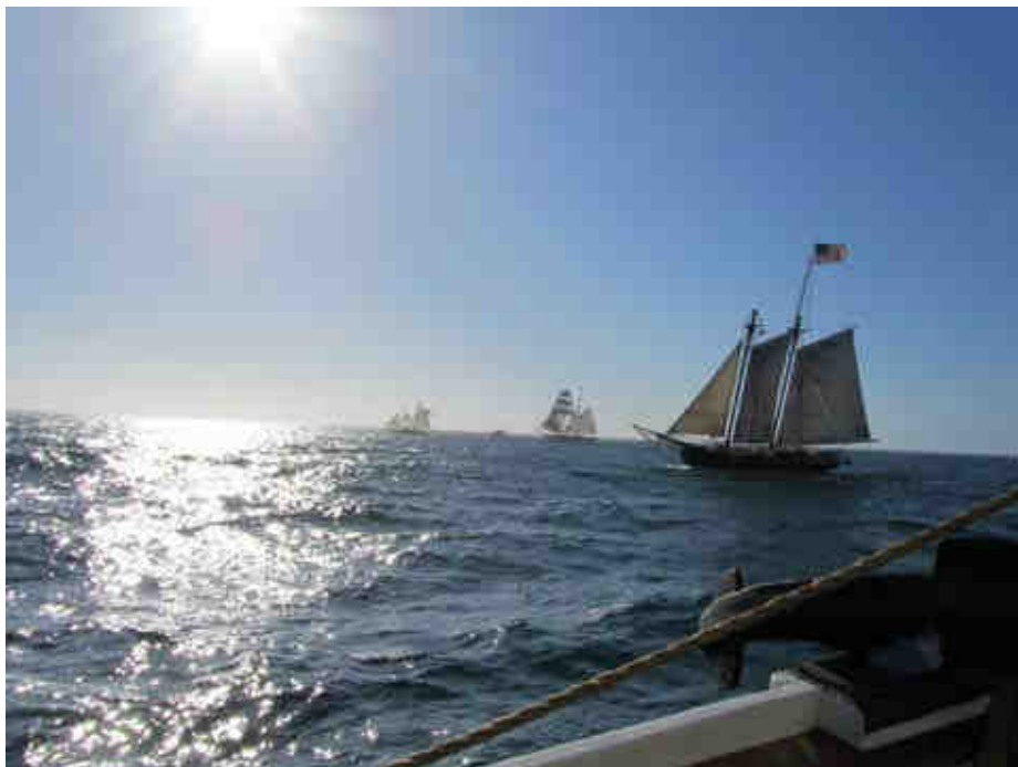
Amazing Grace, Irving Johnson, and Spirit of Dana Point seen from Californian.

The next meeting will be Wednesday, 13 July 2011 aboard the Berkeley at 7:00pm