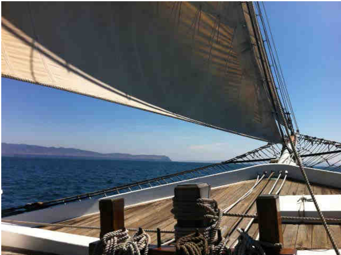
Santa Cruz Island from Californian , July 2012.

The next meeting will be Wednesday, 8 August 2012 aboard the Berkeley at 7:00pm.