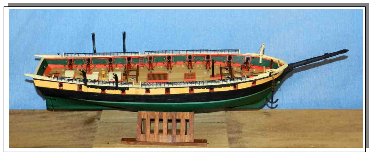
NIAGARA, 1813, scale 1:64. by Royce Privett Since last seen Hammock Nettings have been installed. This presented a problem, which Royce solved by using fish bowl netting, then starched such that it was stiff enough to glue in place between netting ribs. The model is coming along well.