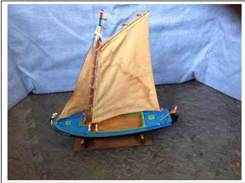
Some of the Museum's model restoration projects