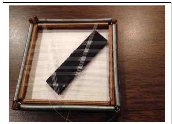
Hewitt's jig for making hatch gratings in micro scale