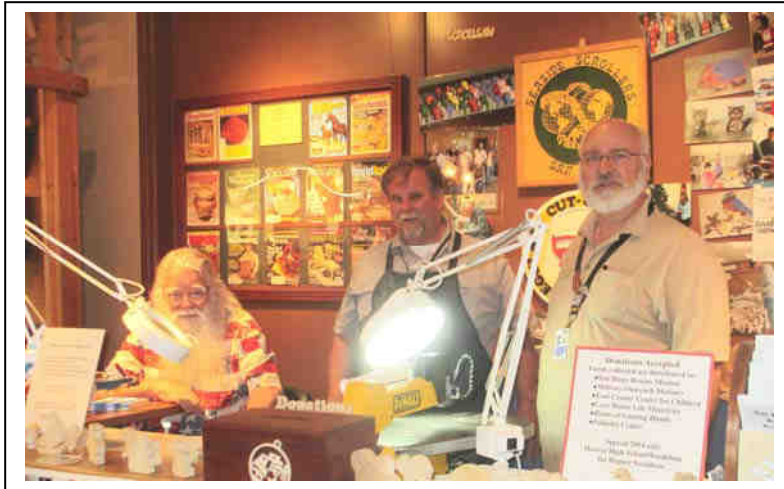
Santa Claus and the Scroll Sawyers