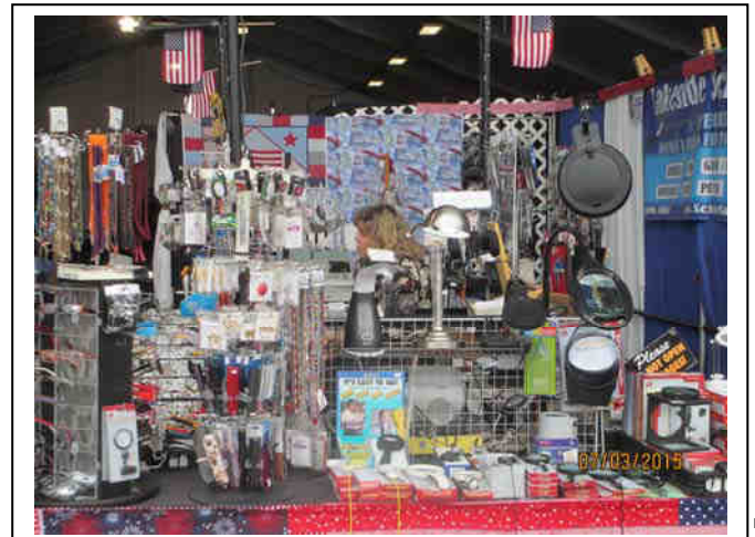
No trip to the Fair would be complete without a visit to the Tool Lady