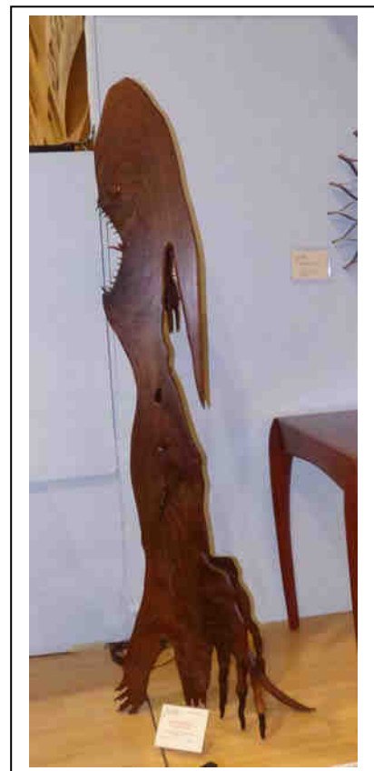
The Mystery Piece