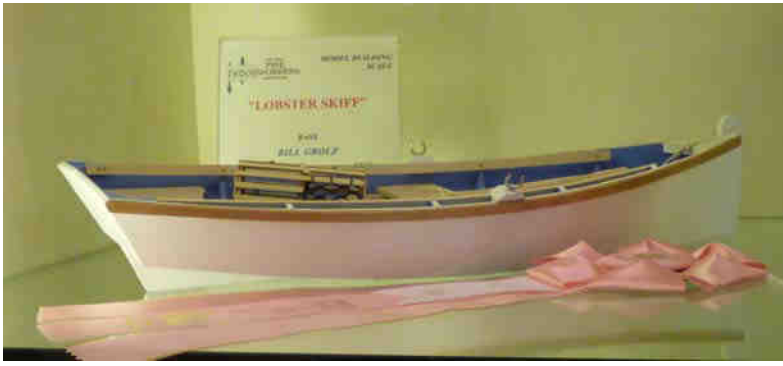
Bill Grolz's LOBSTER SKIFF (Scale Model-4th Place)