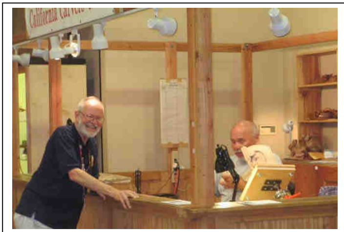
The Carvers-A Quiet Bunch