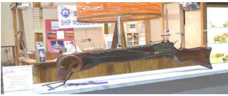
Carved Ram's Head Crossbow (not a ship Model, but Pretty Cool)