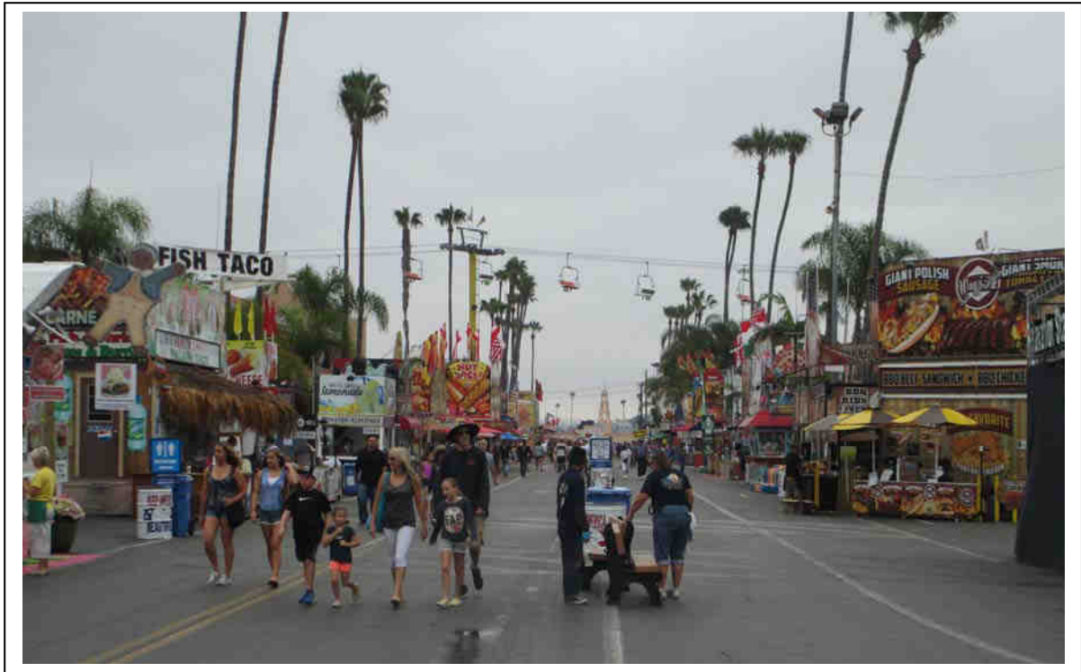
"Main Street". The gates are about to open and the festivities shall start anew.