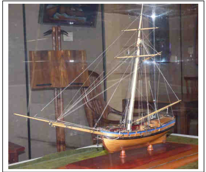
Mike Lonnecker's ARMED VIRGINIA SLOOP 3rd Place-Scale Models SD Maritime Museum Best Scale Model