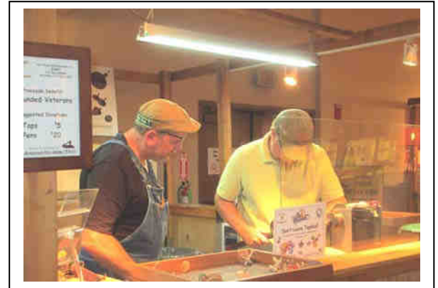
The Wood Turners I SAID, THE WOOD TURNERS