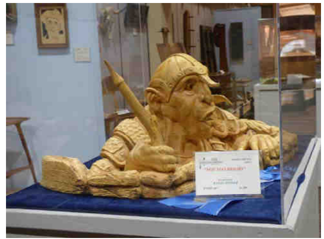
Too Much Fair Food!!!