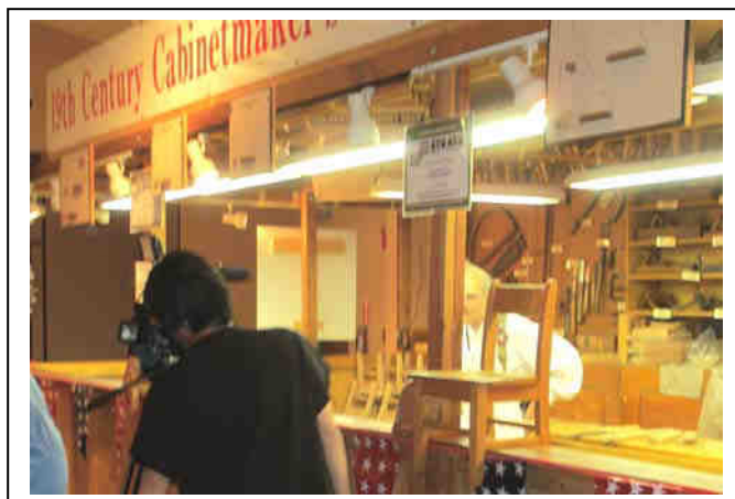
The Chair Makers-An Elusive Bunch