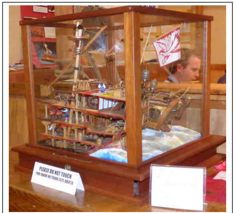
Jay MacMaster's Diorama "The Raptor" 2nd Place-Non scale Models