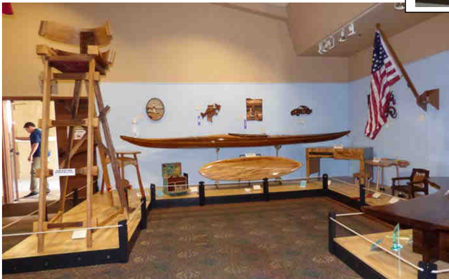
Miscellaneous Woodworking. Is that a wooden flag?