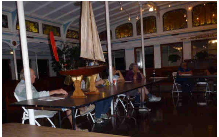
Attention on deck!