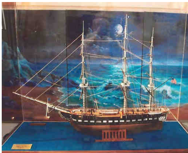
USS Constitution (1812 conversion)