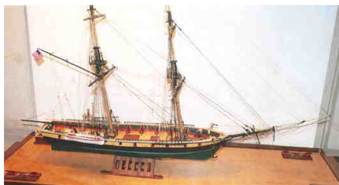
US Brig Niagara (1813)