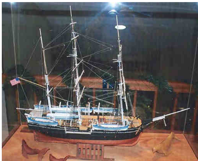
Charles W. Morgan (1841) New Bedford Whaling Bark