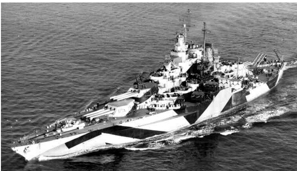
USS CALIFORNIA (BB 44) Jan 44 repaired/reconfigured at PSNSY. This is how CALIFORNIA appeared in Battle of Surigao Straits 25 Oct 44