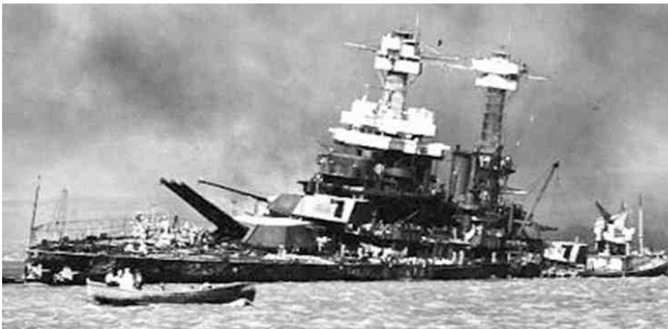
USS CALIFORNIA (BB 44) Dec 1941 with CXAM radar atop pilot house, camouflaged in Measure 1A, Sea Blue up to stack tops, Haze Gray above, Deck Blue on decks sinking off Ford Island, Pearl Harbor, HI