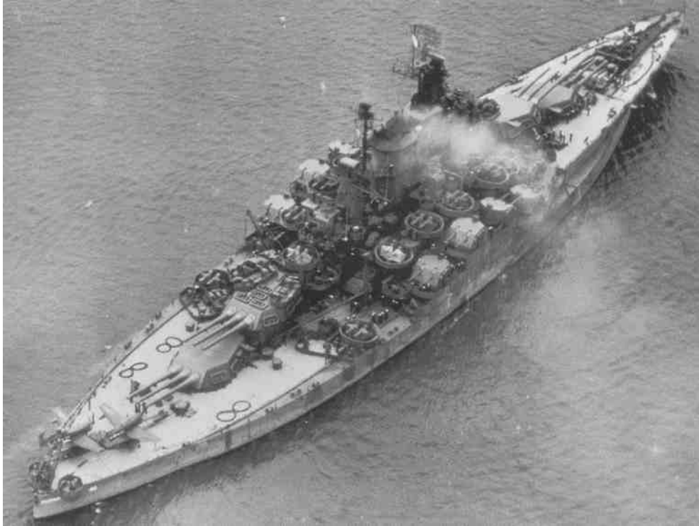
USS CALIFORNIA (BB 44) in Dec 45 as she appeared from after PSNSY repairs following a Jan 45 Kamikaze attack from http://www.navsource.org/archives/01/014468a.jpg