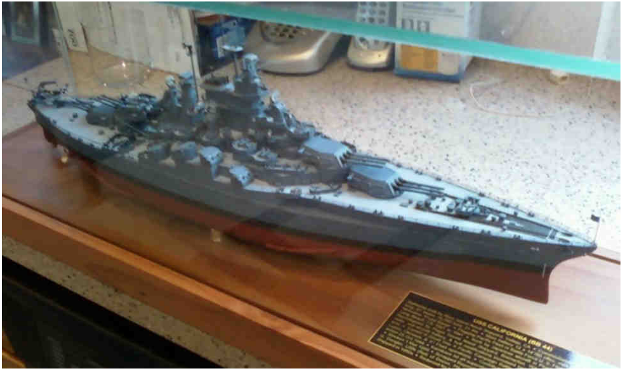
USS CALIFORNIA (BB 44) Model, 11 Dec 2018 in 1945 Configuration

USS Princeton (CG-59) homeported in San Diego and decorated for the Holidays