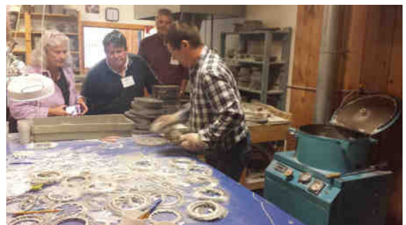
And observe the BlueJacket fittings manufacturing process