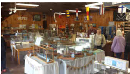
There was opportunity to explore the BlueJacket store and museum