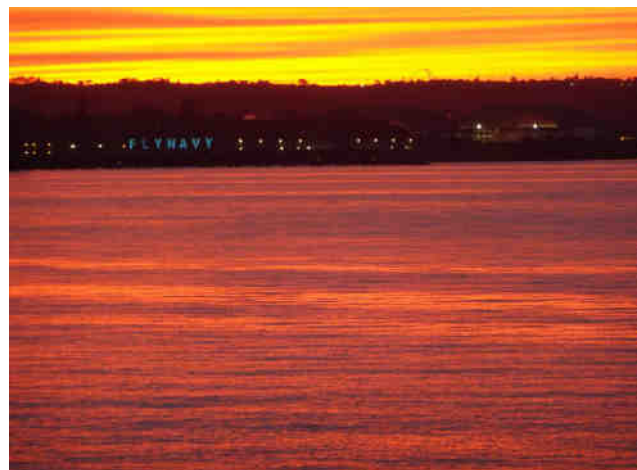
Fly Navy, Indeed!