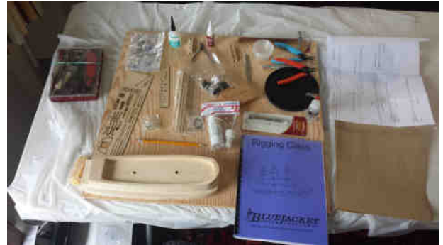
All the materials and tools necessary for the class are supplied though participants are told they may bring their favorite tools with them