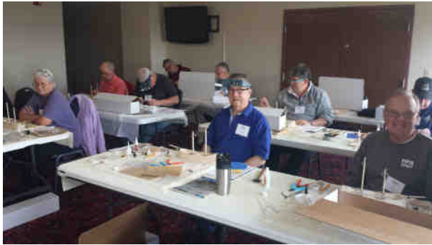
Class size is kept small, in this case 12 participants from all parts of the country, to enhance instruction