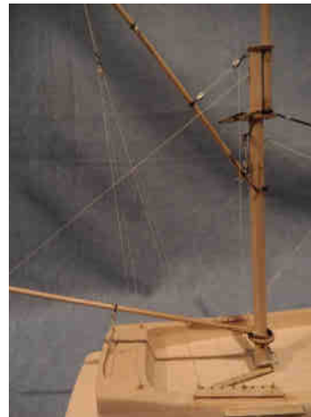
Various rigging applications are explored in the hands-on exercises and the student returns home with their rigging model