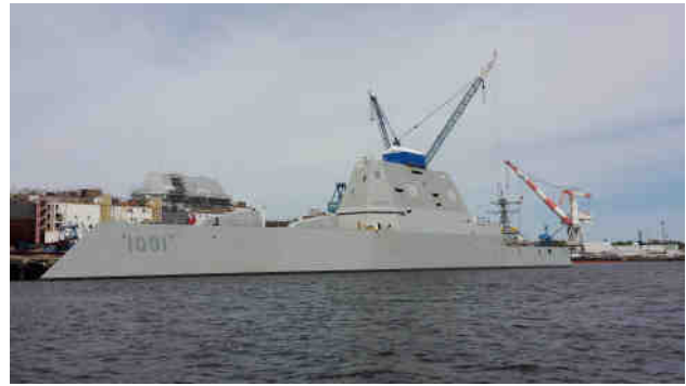
USS Michael Monsoor (DDG-1001) at Bath Iron Works prior to sailing to San Diego for her commissioning on January 26, 2019 at Naval Air Station North Island. She is the first ship ever named after a fallen Navy SEAL.