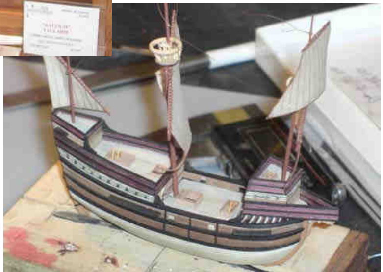
An excellent start to a San Salvador also displayed at the demonstration booth.